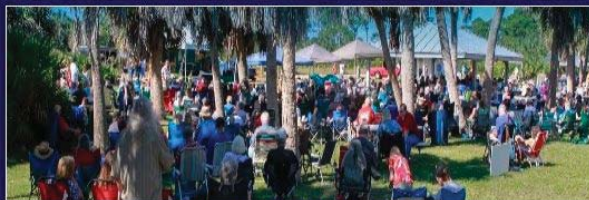
Honeymoon Island State Park

https://www.friendsoftheislandparks.org/40th-birthday